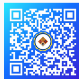
PACK 652 - ALL FAMILIES

While newsletters and calendar reminders are sent via email, Pack 652 uses GroupMe for last minute and in-the-moment communication. Be sure to sign up for the PACK 652 - ALL FAMILIES chat with this QR code. Ask your Den Leader for your Scout's den-specific GroupMe chat.