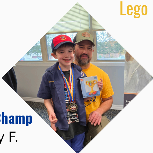
Pack Champ Clay F.